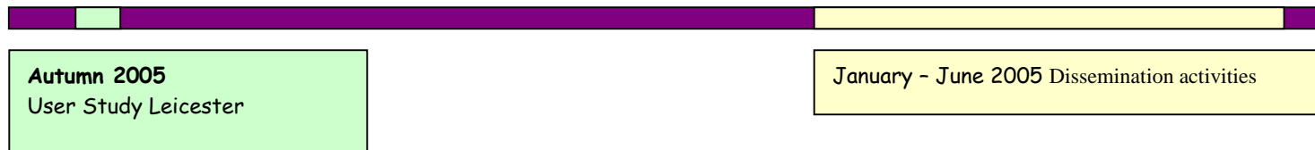
Figure 1 - Evaluation Timeline